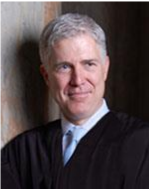
Neil M. Gorsuch (Age: )