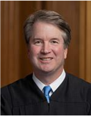
Brett M. Kavanaugh (Age: )