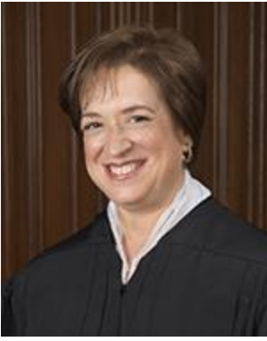
Elena Kagan (Age: )