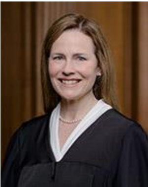
Amy Coney Barrett (Age: )