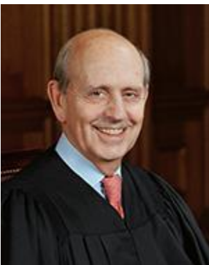
Stephen G. Breyer (Age: )