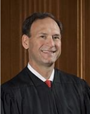
Samuel A. Alito Jr. (Age: )