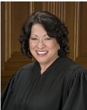
Sonia Sotomayor (Age: )